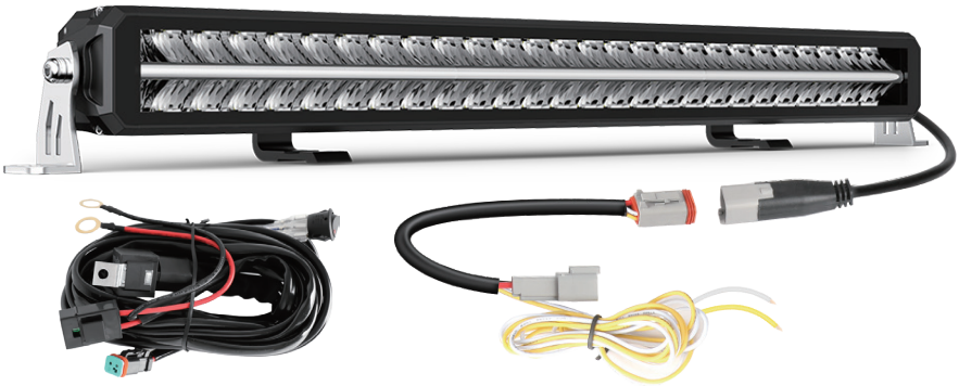
COLIGHT Polar Bear Series Dual Row Light Bar

This user manual provides essential information to ensure you get the best performance and longevity from your new light bar.