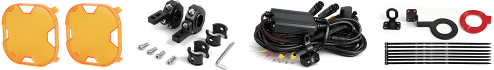
DDF Pro 3inch Motorcycle Auxiliary Lights